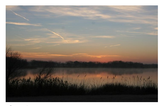
Sunrise at Lake Coldwater

There are currently eight homes located at the lake with approximately 19 areas available.